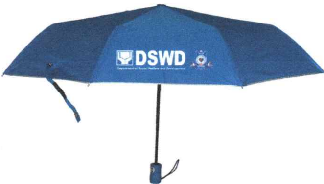
Navy Blue Umbrella *Printed DSWD Logo & Insignia as shown above