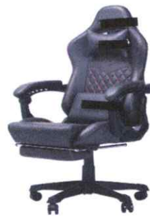
Sample Item No. 6: OFFICE CHAIR