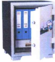
Sample Item No. 1: MONEY VAULT