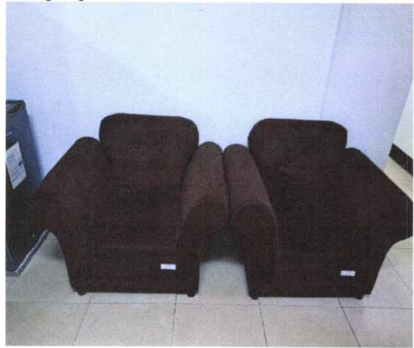
Sample photo for Item No. 08

■ Simple and good quality is the beginning of comfort