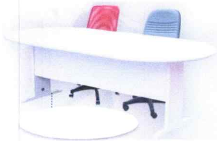
Sample Item No. 5: CONFERENCE TABLE