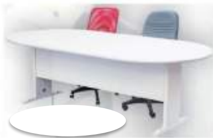
Sample Item No. 5: CONFERENCE TABLE