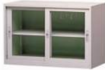
Sample Item No. 3: GLASS SLIDING DOOR CABINET, LATERAL