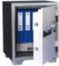
Sample Item No. 1: MONEY VAULT