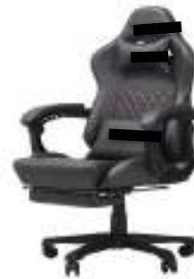
Sample Item No. 6: OFFICE CHAIR