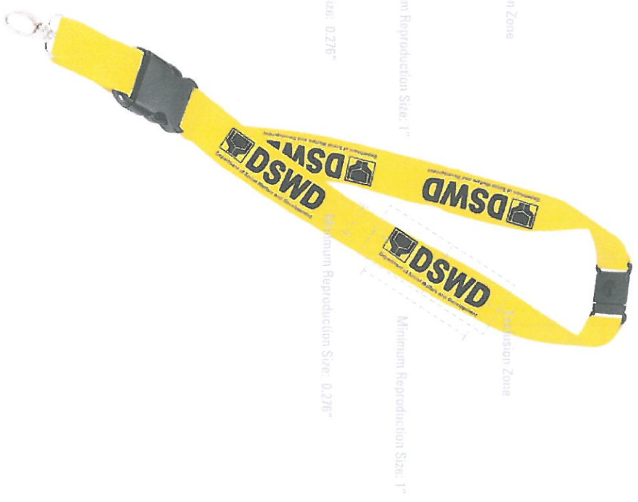
For yellow lanyards, always use black version of the logo