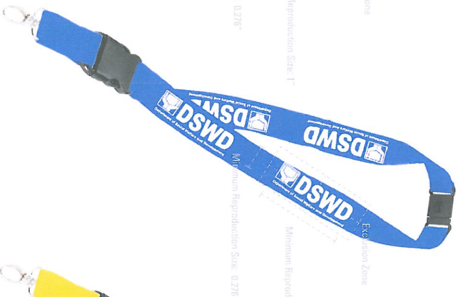
For blue and red lanyards, always use white version of the logo