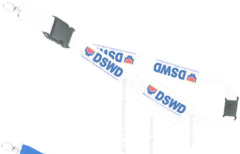
For white lanyards, always use colored version of the logo